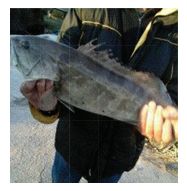
Figure 4 White grouper, Epinephelus aeneus (Geoffroy Saint– Hilaire, 1817): total length 46.70 cm, weight 2.74 kg. Slika 4. Bijela kirnja: ukupna duljina 46,70 cm, ukupna masa 2,74 kg.

Coastal Fisheries: Dynamics, Management, and Ecosystem Science, vol. 9, pp 260-270. https://doi.org/10.1080/19425120.2017.1310155