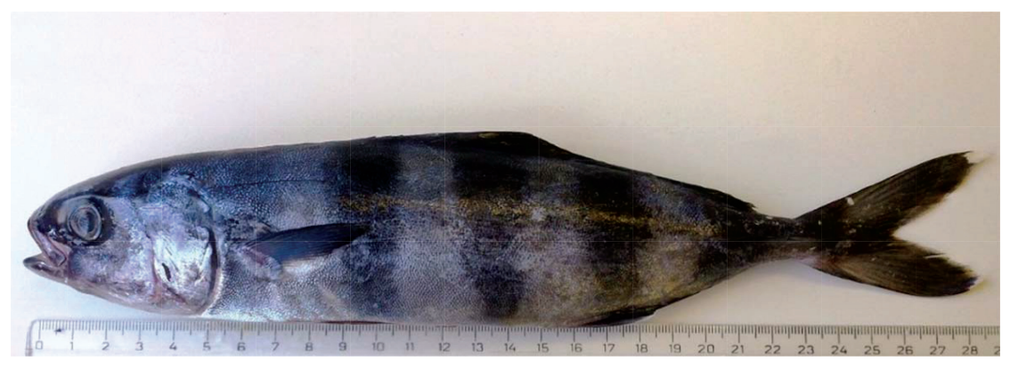
Figure 3 Pilotfish, Naucrates ductor (Linnaeus, 1758): total length 28.71 cm, weight 230.44 g. Slika 3. Skušac pratibrod: ukupna duljina 28,71 cm, ukupna masa 230,44 g.

local food webs and ecology of transitional areas in general. Two species were caught deep in the estuary showing their acclimation to lower salinity which enables them to enter most important nursery area for juvenile recruitment. These indications are clear sign of significant changes of present ecosystems and local fishery associated with estuarine resources, as previously described for impact of bluefish on grey mullet species and local artisanal fishery associated with them [4].