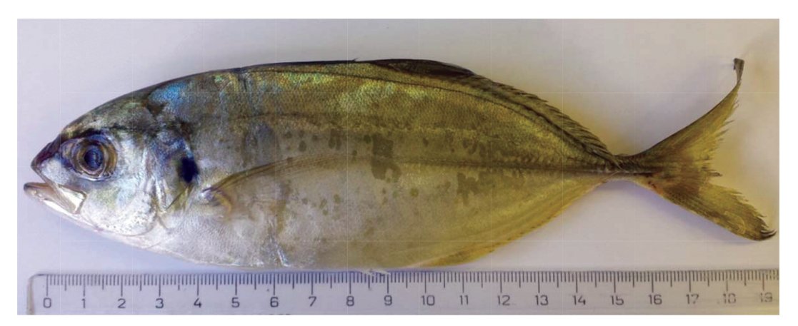
Figure 2 White trevally, Pseudocaranx dentex (Bloch & Schneider, 1801): total length 19.39, weight 94.42 g. Slika 2. Trnbokan plosac: ukupna dužina 19.39, težina 94.42 g.

Impact of these species has to be investigated in more details, but present data on food composition and literature data on feeding preferences, indicate that these species should impact important fish (i.e. big-scale sand smelt) or crustaceans (i.e. Melichertus kerathurus ) in the River Neretva Estuary, changing