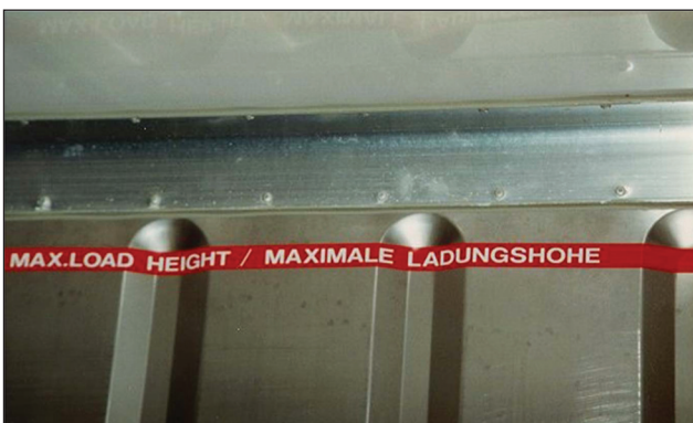
Figure 3 Maximum load height in refrigerated container [6] Slika 3. Maksimalna visina opterećenja u rashladnom kontejneru [6]

Refrigerated containers with integrated cooling units can be stored below or above deck of the ship. The advantage of location of container on deck is that, there is a better circulation of heat from container into the environment. On the other hand these containers have to face direct sun light. It increases the requirements for the cooling unit [6].