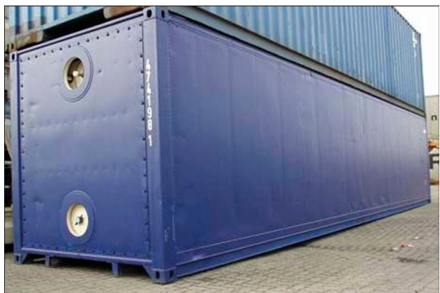
Figure 4 Porthole container [8] Slika 4. Izolacijski kontejner [8]

This type of containers is often marked not as refrigerated containers, but as isolated containers because they do not have an integrated cooling unit. These containers have a bigger internal space because of the absence of a cooling unit. The air flows in the same way as in containers with integrated units. Cold air is blown in the bottom and a warm air is removed at the top.