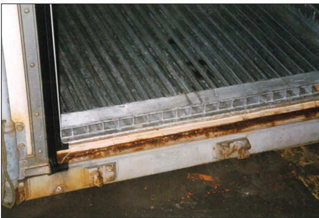
Figure 2 Floor refrigerated container [6] Slika 2. Rashladni kontejner s hladnim dnom

The temperature of containers is continuously measured and the temperature display is located outside of the cooling unit so that the operation unit could be controlled any time.