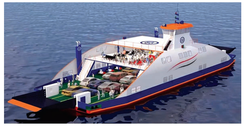
Figure 2 New Design of Port Said Passenger-Car Ferries Slika 2. Novi dizajn trajekata za prijevoz putnika i vozila u Port Saidu