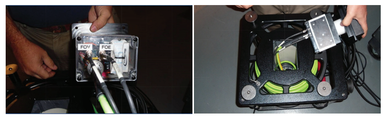
Figure 10 The Cable line drum with the optical signals to electrical signals converter Slika 10. Bubanj s kabelima s pretvaračem optičkih signala u električne signale