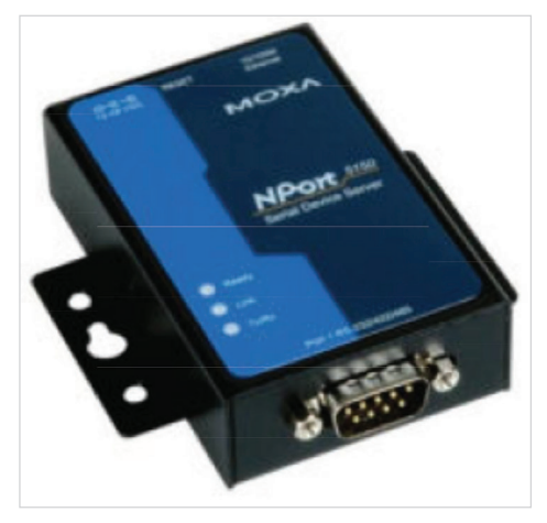
Figure 9 NPort 5150A Converter Slika 9. Pretvarač NPort 5150A

The RS-232/Ethernet Moxa converter (Figure 9) used in the system creates the bridge between the serial interface and Ethernet network.