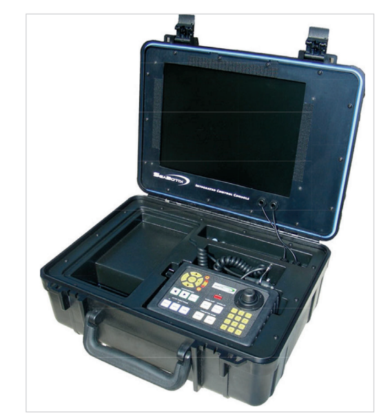
Figure 5 Operator console LBV 200-4 Slika 5. Konzola operatera LBV 200-4

Together with the vehicle there is the operator console with a 15" color monitor, and a set of manipulators (Figure 2) provided by the Teledyne SeaBotix Company. The joystick is used to control the movement in the horizontal plane, that is forward and backward and turn right and left, while the knob is used to control the submerging. The other controls shown in Figure 4 and Figure 5 are used to control the movement of the camera, switching its lights, the switching on the power, etc. To send commands to the vehicle and receive information from the sensors the serial port is used.