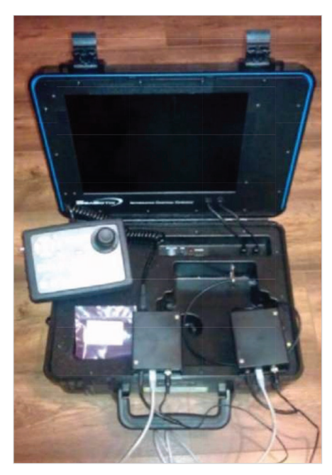
Figure 8 The test post Slika 8. Testno mjesto

For this purpose, the conversion of control signals sent between the ICC and the OCU from the serial transmission to Ethernet with the MOXANPort 5150A converters was used. The scheme of testing post is shown in Figure 8.