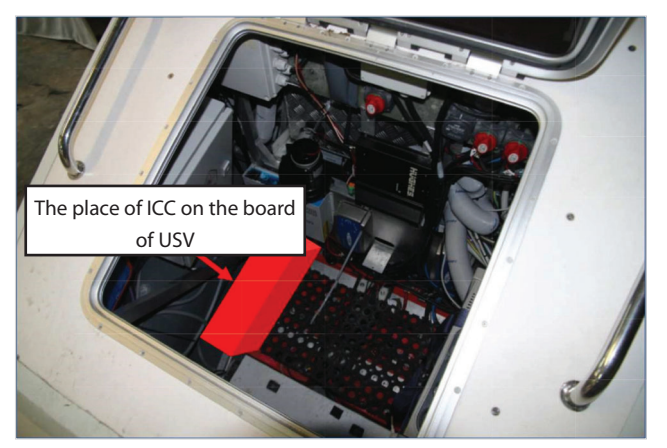
Figure 6 Location of the ICC on the USV board Slika 6. Položaj ICC-a na ploči USV-a

From the three above mentioned possible solutions, the one where the ICC is placed on the USV platform (Figure 6), the OCU manipulator is moved to the Command Post, and sending video images with the help of video server from ROV to USV were chosen. The ICC control unit installed on the USV platform was integrated with existing radio communications solutions and network systems. The flowchart of the developed solution is shown in Figure 6.