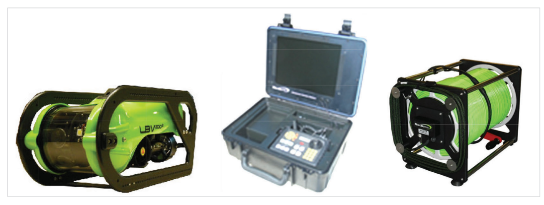
Figure 2 The set of the system of the underwater vehicle UBV200-4 Slika 2. Sustav ronilice UBV200-4