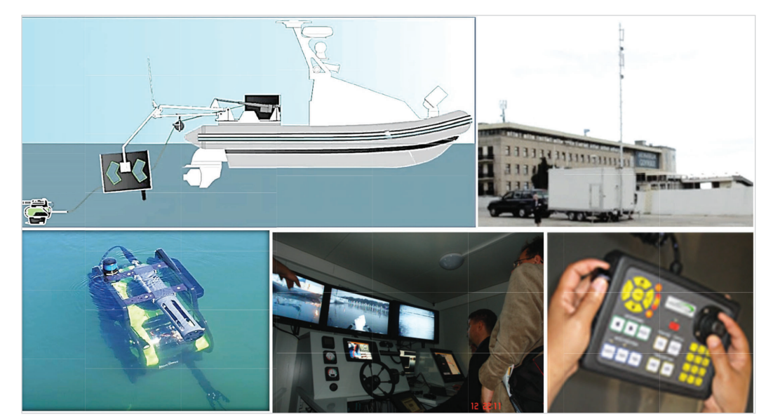
Figure 11 The structure of remote control system of an underwater vehicle by the operator from the mobile Command Post USV Slika 11. Struktura sustava daljinskog upravljanja ronilicom kojom upravlja operater iz mobilnog zapovjednog mjesta

to digital form, encoding of the video stream using "ffmpeg" and the transfer of data frames using the UDP protocol. So formatted packets of data are transmitted by the AirSpan WiMax radio connection and get to the PC located in the Command Post.