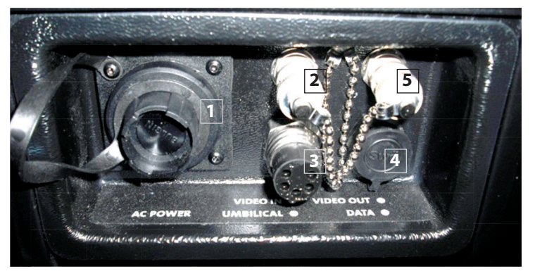
Figure 3 The control unit of the ICC (Integrate Control Console) 1. The AC power connector of the control unit ICC, 2.. The input of video signal from the ROV vehicle, 3. The power connector for ROV's engines, 4. The data transmission connector (RS232), 5. The video signal output.

Slika 3. Upravljačka jedinica ICC (integrirane upravljačke konzole)