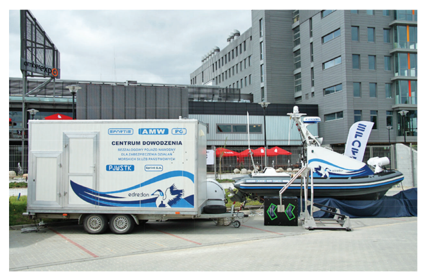
Figure 12 The USV "Edredon", the mobile command post and the system of launch and recovery of the underwater vehicle ROV LBV200-4. Slika 12. USV "Edredon", mobilno zapovjedno mjesto i sustav porinuća i povlačenja ronilice ROV LBV200-4.

Figure 11 The structure of remote control system of an underwater vehicle by the operator from the mobile Command Post USV Slika 11. Struktura sustava daljinskog upravljanja ronilicom kojom upravlja operater iz mobilnog zapovjednog mjesta