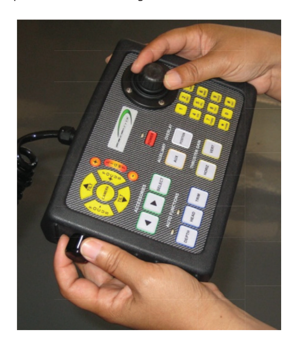
Figure 4 The OCU Manipulator Slika 4. OCU Manipulator

Control of the vehicle LBV200-4 is done using the manipulator OCU shown in Figure 4.