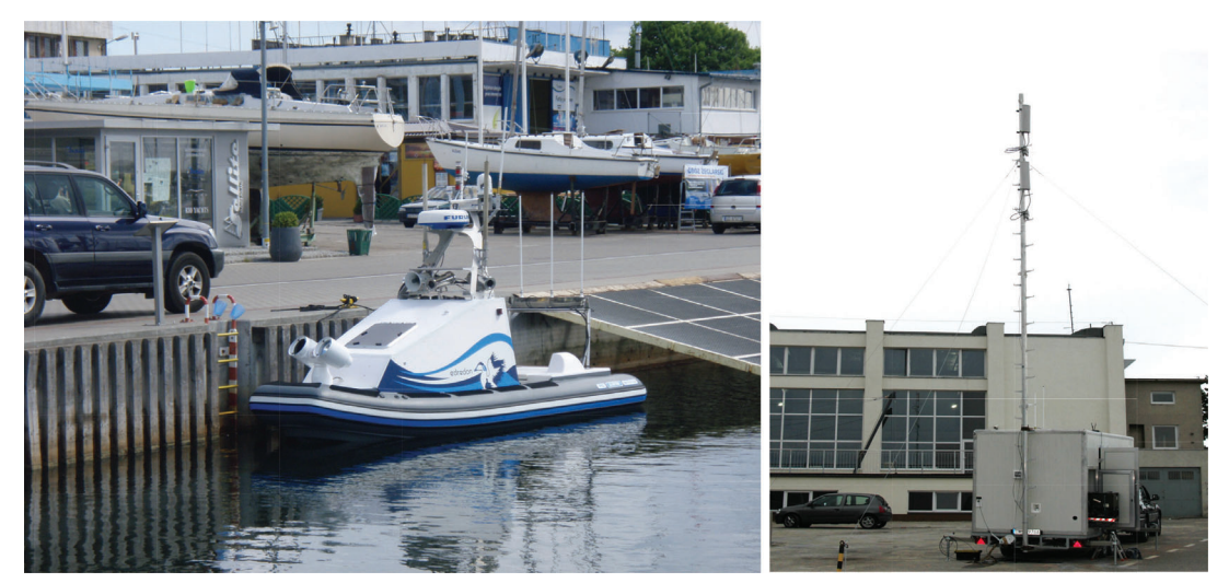
Figure 1 The view of the vehicle and the Command Post (container) Slika 1. Vozilo i zapovjedno mjesto (kontejner)