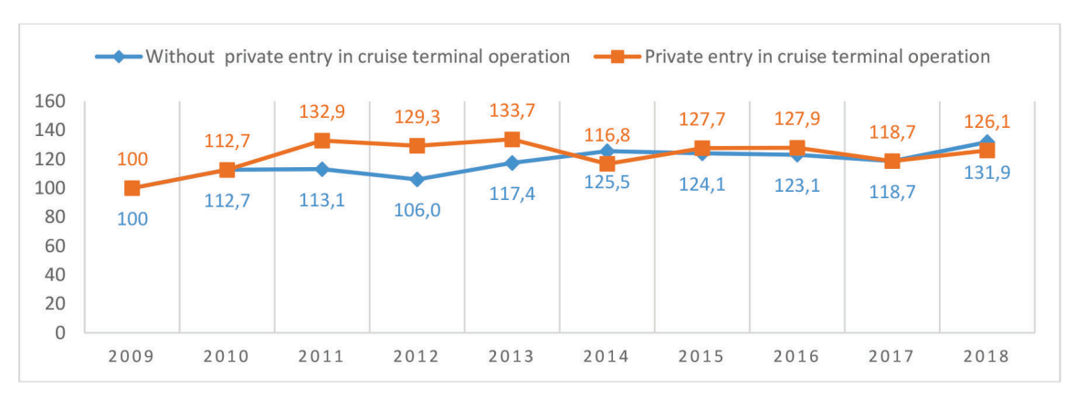
Graph 4 Cruise passengers index in cruise ports with regard to port governance Grafikon 4. Indeks putnika na kružnim putovanjima u lukama s obzirom na tip upravljanja lukom

GRIpax (Figure 4) is index that monitors the annual trend of cruise port passenger flows in ports without and with private entry in port operation. The index has 2009 as the base year (GRIpax=100). The evolution of cruise passenger flows since the base year is presented respecting the type of port governance. The imbalanced nature of both types of port governance is illustrated. No clear trend, single or comparative, as well as outperformance of one type of port governance can be identified. There is no statistically significant difference in the annual growth rate of cruise passengers between the two types of port operation (p>0.1). The cumulative growth rate for the period 2009-2018 of cruise passengers in cruise ports without private entry in port operation in the observed period is CAGR=3,1%, while the cumulative growth rate of cruise passengers in cruise ports with private entry in port operation is CAGR=2,6%.