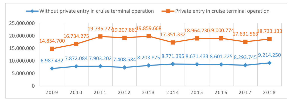
Graph 2 Cruise passenger flows in cruise ports with regard to port governance Grafikon 2. Kretanja putnika u lukama za kružna putovanja s obzirom na upravljanje lukom