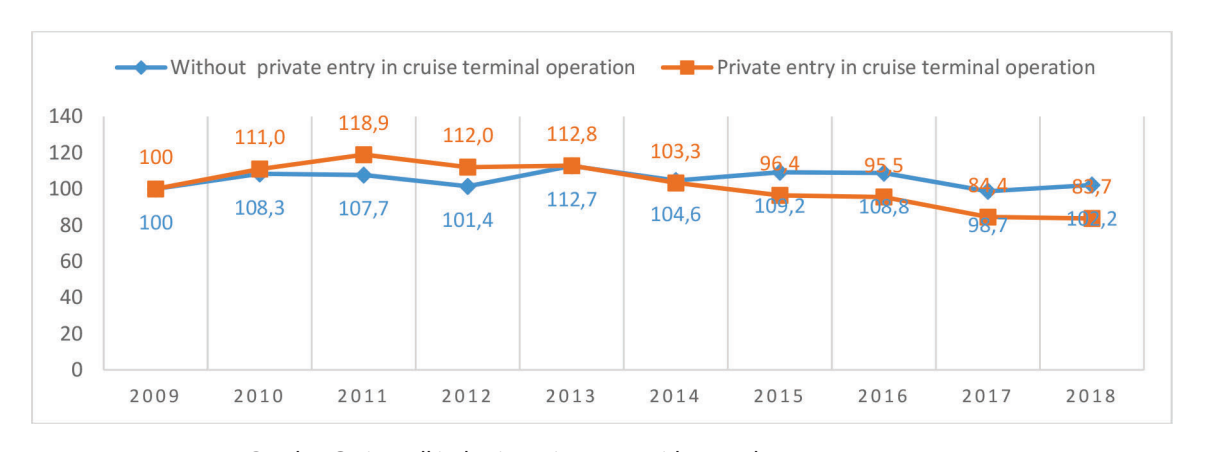
Graph 5 Cruise call index in cruise ports with regard to port governance Grafikon 5. Indeks ticanja luka za kružna putovanja s obzirom na tip upravljanja lukom

GRIpax/call (Figure 6) is index that monitors the annual trend of average cruise port passengers per cruise call in ports without and with private entry in port operation. The index has 2009 as the base year (GRIpax/call=100). The evolution of cruise passengers per cruise call since the base year is presented respecting the type of port governance. The figure points out continuous growth of passengers per call in both types of port governance, whereby the growth rate of ports with private entry in port operation is higher compared to ports without private entry in port operation. Ports with private entry in port operation have a growth rate of cruise passengers per cruise call of 50,7% in 2018 compared to 2009, while ports without private entry in port operation have in the same period a growth rate of cruise passengers per cruise call of 27,4%. There is no statistically significant difference in the annual growth rate of cruise passengers per call between the two types of port operation (p=0.1). The cumulative growth rate for the period 2009-2018 of cruise passengers per call in cruise ports without private entry in port operation in the observed period is CAGR=2,7%, while