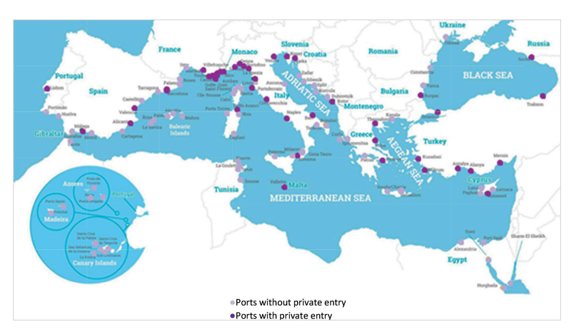
Figure 1 Mapping of cruise ports in the Mediterranean and adjoining seas with regard to port governance Slika 1. Prikaz luka za kružna putovanja na Mediteranu i susjednim morima s obzirom na upravljanje lukama

The Mediterranean and adjoining seas as a cruising region is divided in four regions: Western Mediterranean, Eastern Mediterranean, Adriatic Sea and Black Sea. Table 2 shows the distribution of ports without and with private entry in port operation within the regions.