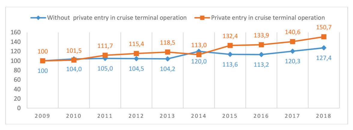
Graph 6 Cruise passengers per call index in cruise ports with regard to port governance Grafikon 6. Putnici na kružnim putovanjima prema indeksu ticanja luka s obzirom na tip upravljanja lukom

the cumulative growth rate of cruise passengers per call in ports with private entry in port operation is CAGR=4,7%.