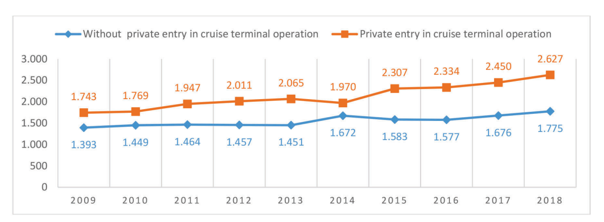
Graph 3 Cruise passengers per call in cruise ports with regard to port governance Grafikon 3. Putnici na kružnim putovanjima po ticanju s obzirom na tip upravljanja lukom

The cruising industry remained stable as cruising activities have been growing for the last two decades recording admirable growth rates despite of economic cycles and uncertain political climates. The middle term reflection of cruising activities indicates annual variations in cruising activities. In order to facilitate the monitoring of cruise activity trends three indexes were established, aiming to give a clear picture of the evolution of cruise passenger flows (GRIpax), cruise calls (GRIcalls) and cruise passenger per call (GRIpax/call) respectively to the type of port governance.