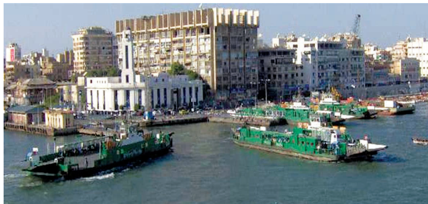
Figure 1 Old Design of Port Said Passenger-Car Ferries Slika 1. Stari dizajn trajekata za prijevoz putnika i vozila u Port Saidu