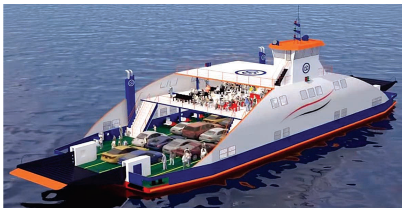
Figure 2 New Design of Port Said Passenger-Car Ferries Slika 2. Novi dizajn trajekata za prijevoz putnika i vozila u Port Saidu